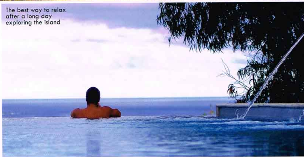
The best way to relax after a long day exploring the island

in buses. Paths were created just for this. Each day, guests can choose from a menu of adventures. The walks can go as long as four hours, and each trek leads to different points in the island. There are also cycling and kayaking tours with graduating levels of difficulty. Explora Lodge provides top-of-the-line bicycles, kayaks and other equipment for these trips.