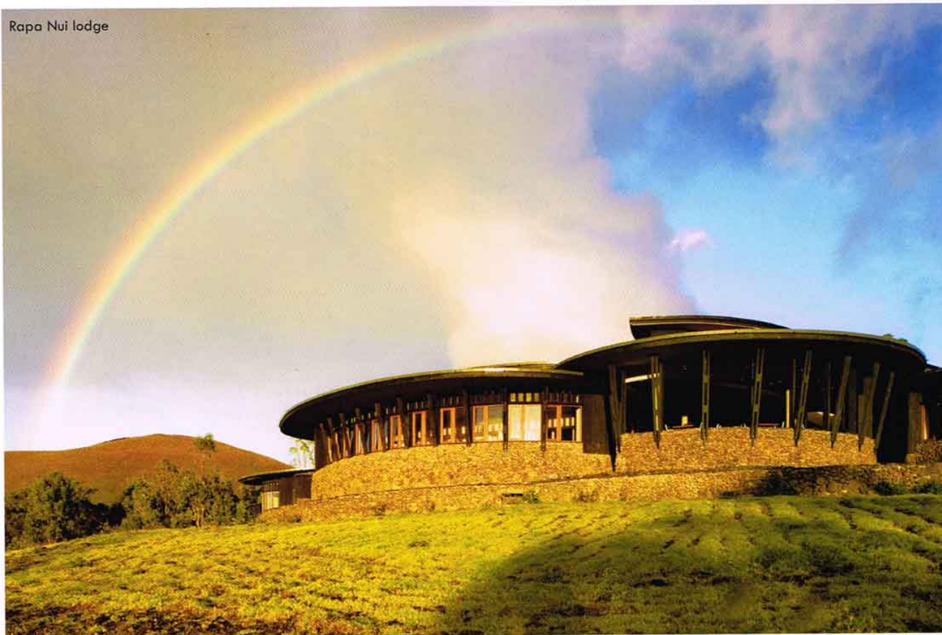
Rapa Nui lodge

design to the environs. Each is particularized to blend with the surroundings and maximize the natural climate.